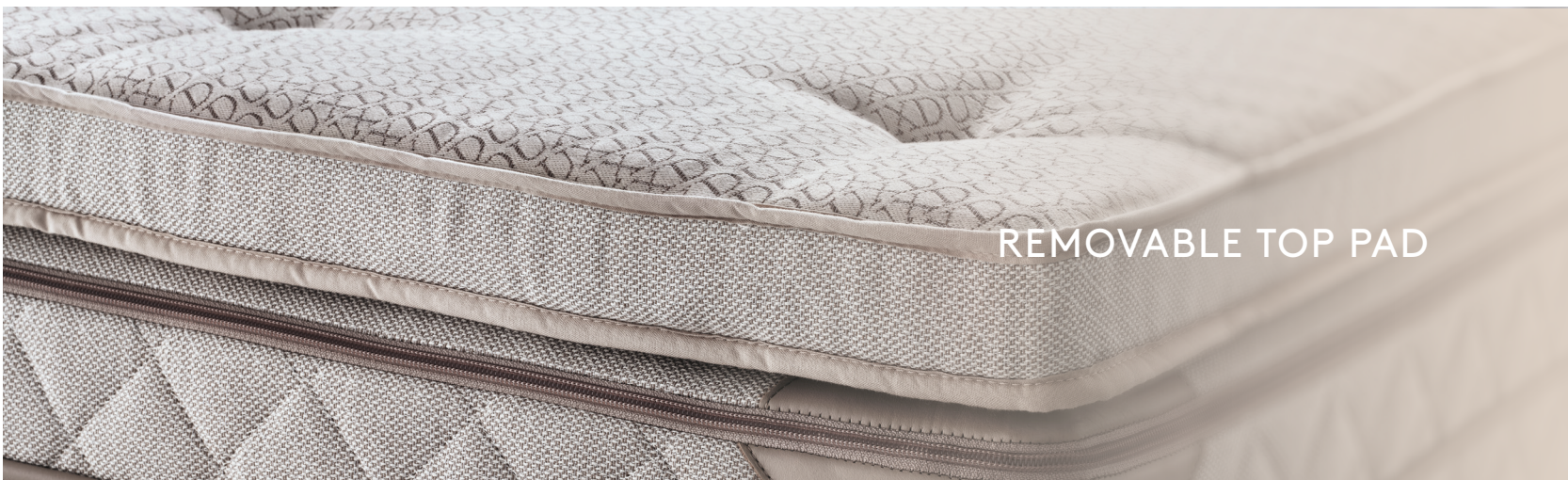
REMOVABLE TOP PAD