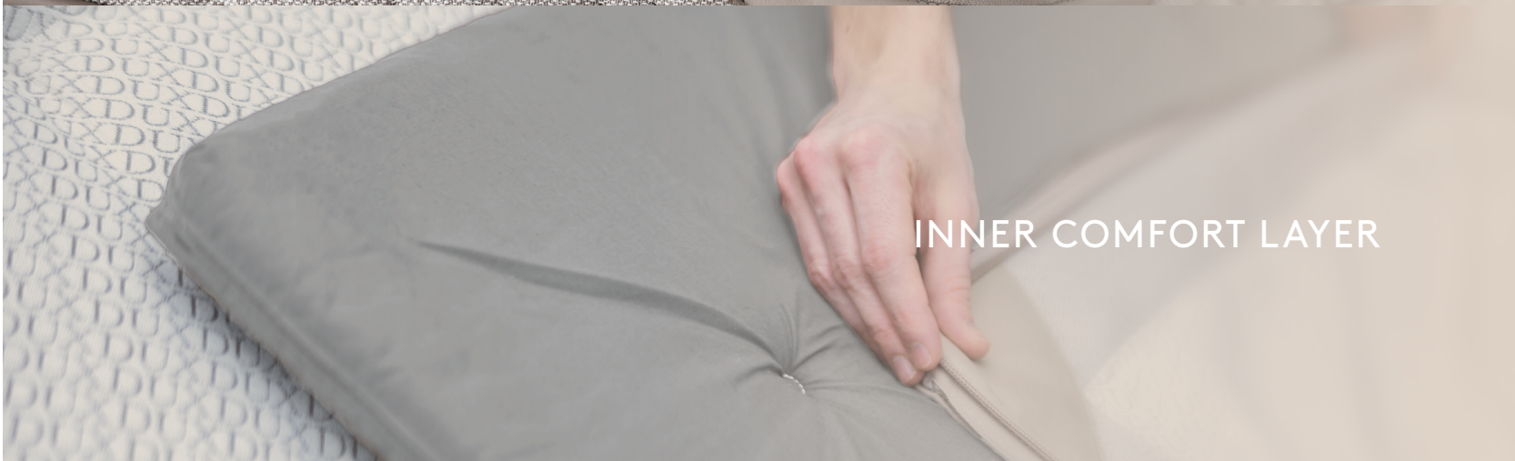
INNER COMFORT LAYER